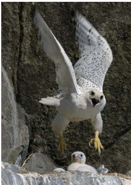
This film follows the perilous parenthood of two species — white gyrfalcons and Arctic wolves — on Canada's remote Ellesmere Island. Join KMBH for "Nature: White Falcon, White Wolf." Monday, October 26th at 7pm.

7:00 WASHINGTON WEEK 7:30 NOW ON PBS 8:00 CONSUELO MACK WEALTHTRACK 8:30 McLAUGHLIN GROUP 9:00 BILL MOYERS JOURNAL 10:00 REPORTERO 10:30 TO THE CONTRARY W/ BONNIE ERBE 11:00 CHARLIE ROSE