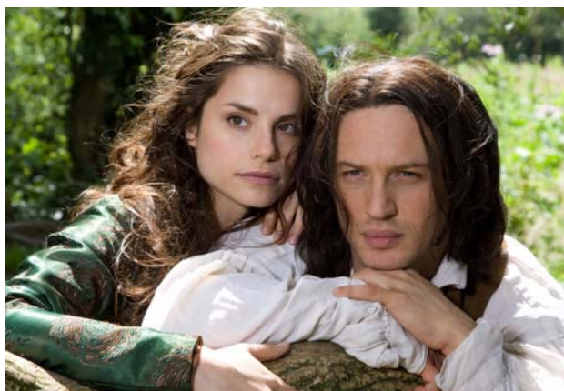
Charlotte Riley (left) stars as Cathy and Tom Hardy (right) as Heathcliff in Masterpiece Classics adaptation of «Wuthering Heights». Sunday, January 18th and 25th at 8pm.

7:00 NOVA «The Big Energy Gamble»- NOVA examines California's aggressive pursuit of a sustainable energy future. 8:00 FRONTLINE «Dreams of Obama»-On the night of Barack Obama's historic inauguration, FRONTLINE examines the rich personal and political biography of the 44th president of the United States. 9:00 INDEPENDENT LENS «Please Vote For Me»-Eight-year-old students in an elementary school in China campaign for school monitor. 10:00 HIDALGO CO. COURT