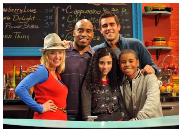
Join KMBH for all new episodes of «The Electric Company,» Fridays beginning January 23, 2009 at 4:30pm with special guests like Tiki Barber pictured with the cast.