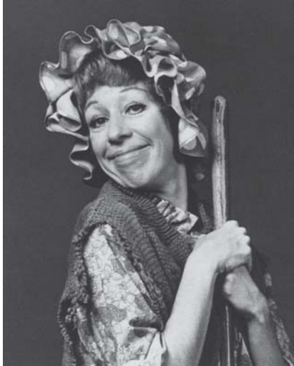
Exclusive interviews with comedians, writers and producers provide perspectives on American comedy and those who created it. Pictured: Carol Burnett. In "Make 'Em Laugh" Wednesdays January 14th-28th at 8pm.