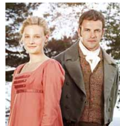
Masterpiece Classic: Emma

7:00 ANTIQUES ROADSHOW «Atlantic City» (Hour Three)-A fanciful circa 1900 folk art sculpture; a 1934 New York Yankees team-signed baseball; and an early 20th-century painting by George Bellows. 8:00 THE BOMBING OF GERMANY: AMERICAN EXPERIENCE