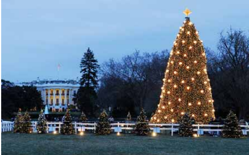
National Christmas Tree Lighting Thursday, December 10th @ 8 p.m.